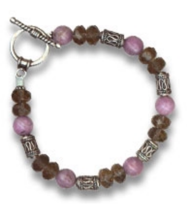
Lepidolite Bracelet Web site item #234b