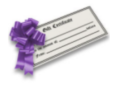
We offer complimentary gift-wrap and gift certificates!

While visiting the "Beautiful Bracelet Blowout", take a look at all the other jewelry to compliment your new bracelets! Also, please visit the personal profile page there for you to fill out your favorite colors, preferences, and styles to make gift giving easier!